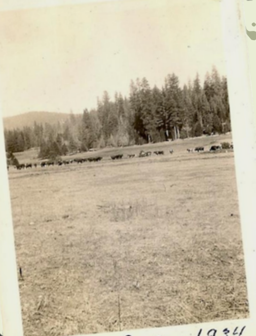
Camp Lassen Camps 1934